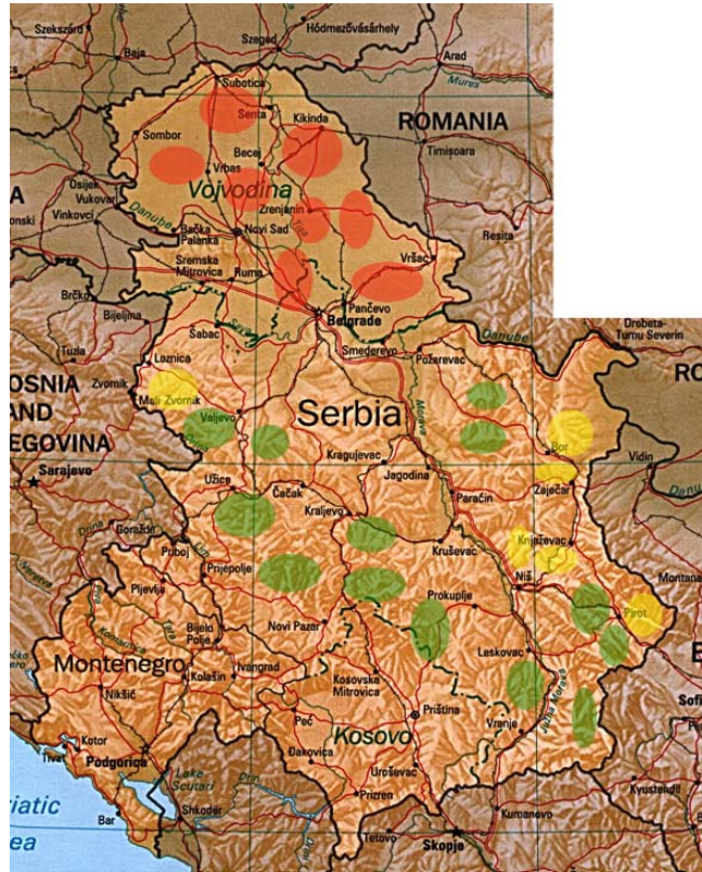
Fig 1. Map of medicinal plant production in Serbia: red spots – cultivation area; yellow – wild collectin;, green- sporadic collecting, but rich natural resources